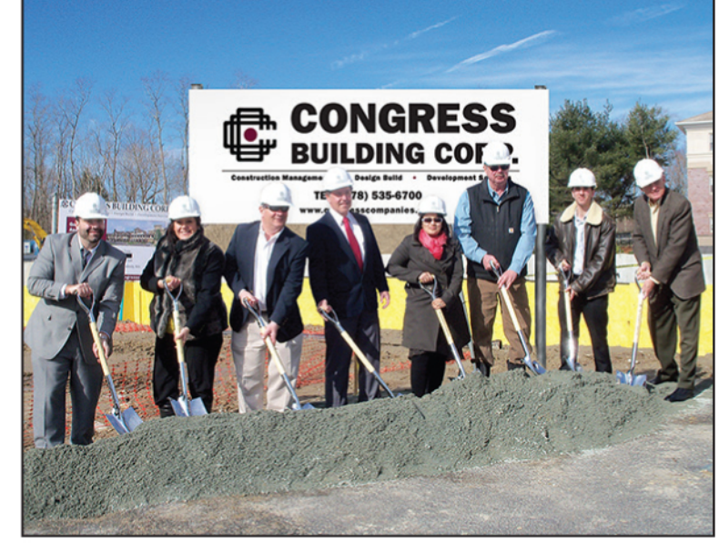
The Congress Companies and Golden Pond Resident Care Corp. co-hosted a groundbreaking ceremony on March 13, 2013 to celebrate commencement of construction on phase 2 of Golden Pond Assisted Living Residences in Hopkinton, Mass.