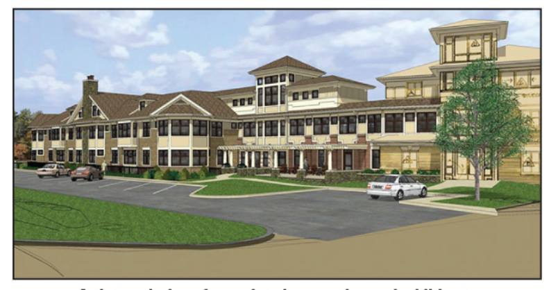
Artist rendering of completed renovation and addition to Golden Pond Assisted Living Residences in Hopkinton, Mass.

Congress' commitment to its consultative approach, to listening to its clients' needs and vision is what has made the company so well regarded in the surety, banking, and the development and construction communities. As a solid and reliable company with formidable construction, design and development, and management capacity, Congress will undoubtedly continue its legacy into a future as rich as its history.