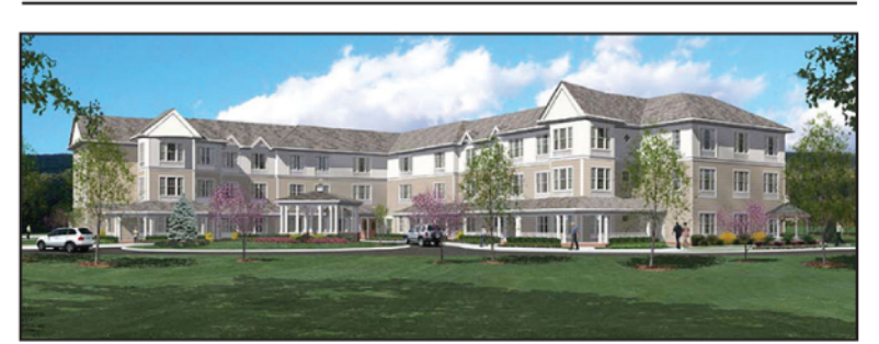
Artist rendering of The Residence at South Windsor Farms, a senior community being built by The Congress Companies in South Windsor, Conn.